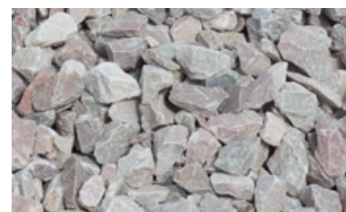
3/4" Cheyenne Gray Rock.