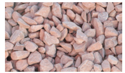
1 1/2" Colorado Red Rock