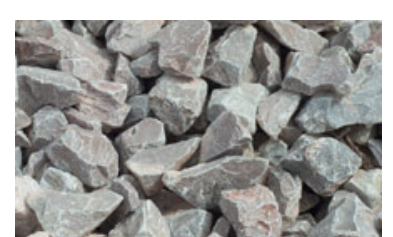
1 1/2" Cheyenne Gray Rock