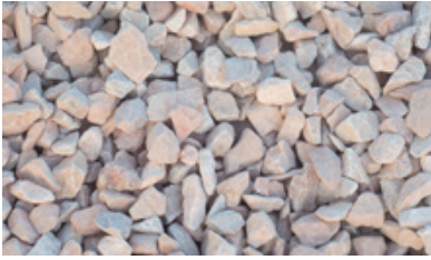
• 3/4" Tri-Color Rock.