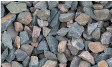
• 3/4" Mountain Granite Rock