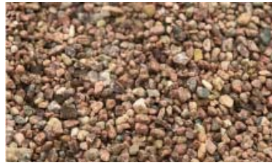
Glacier Rock Pea Gravel