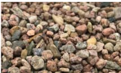
• 3/4" Glacier Rock