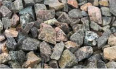
Pathway Granite 1/2"