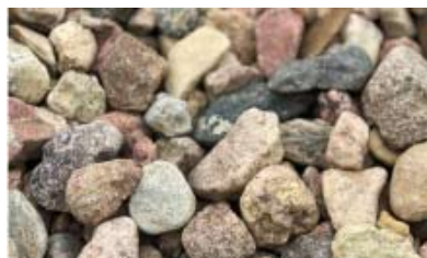
1 1/2" Glacier Rock