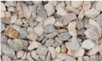
• 3/4" Butter Rock