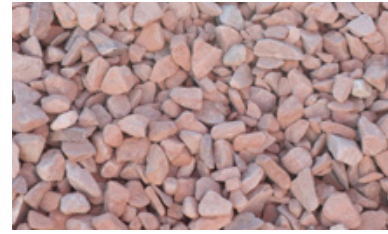
3/4" Colorado Red Rock