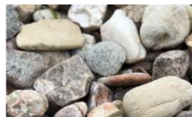
2" Glacier Rock