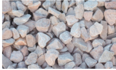
1 1/2" Tri-Color Rock