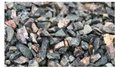
Pathway Granite 1/4"